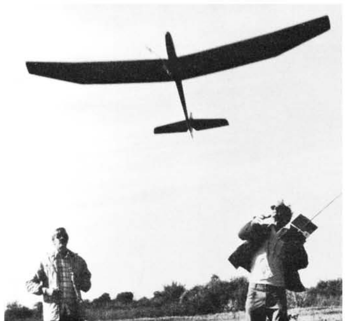
Jack Nunn launches Aquila on way to first in Standard class at Ottawa.