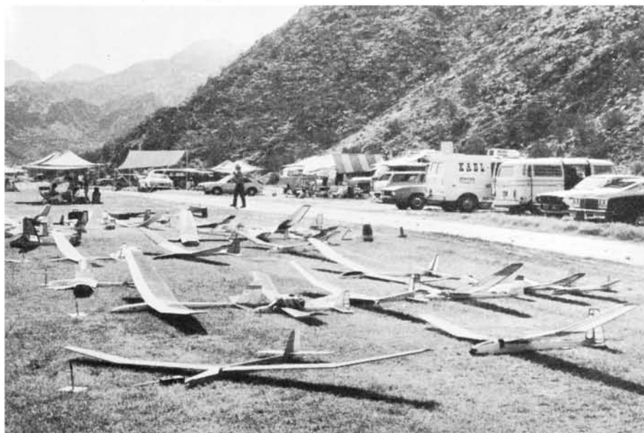
The ready line at Palm Springs. With sites separated by such great distances, it is natural that both terrain and weather vary greatly, making for a wide assortment of flying conditions.