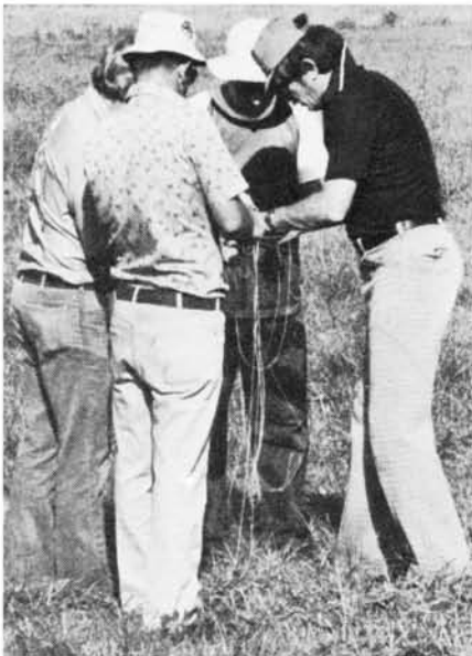
Nemesis of sailplaners—the tangled winch line. This scene from the Redmond Regional. They were not alone at it either, we hear.